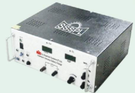
Solartech Universal Battery Charger