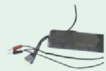
HHTS ISRAEL Connector