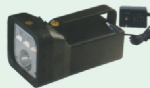
Solartech MHD 4 (2 in 1)