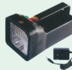
Solartech RWGSM 2