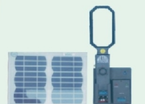
Solartech Hand Held Metal Detector