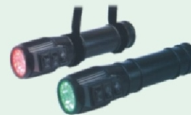
Solartech RWGS 1