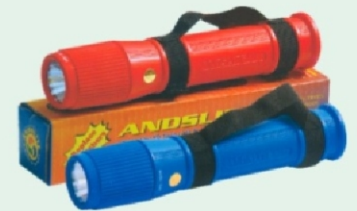
Solartech DBR 1/ DBEX 1