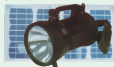
Solartech Hand Held Search Light