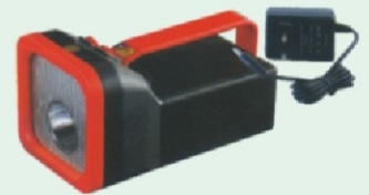
Solartech MHD 1