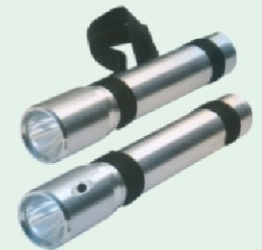
Solartech DMRX 3/4