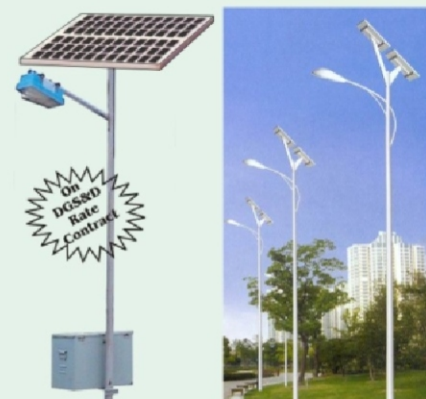
Solartech Security/Street Light