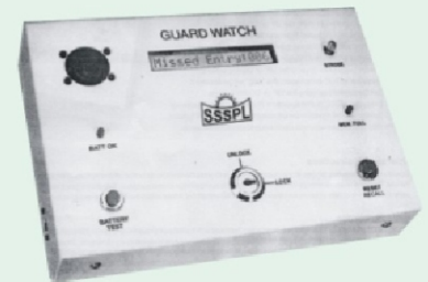
Solartech Guard Watch Monitor