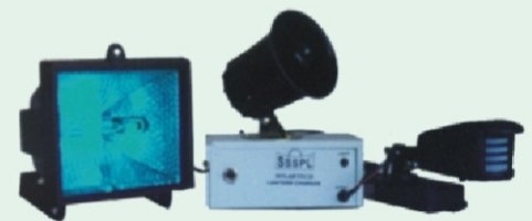
Solartech IR Sensor With Hooter & Halozen Light