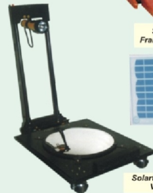
Solartech Under Vehicle Viewing Mirror