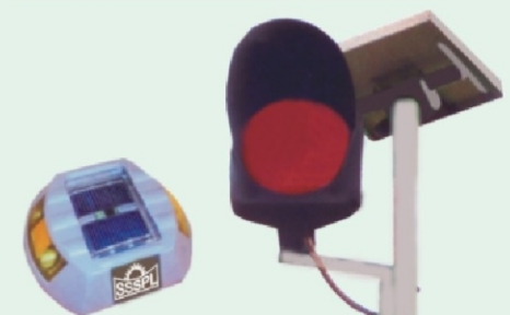
Solartech Road Studs